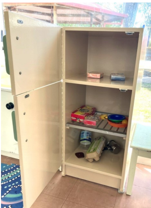
Repaired and painted wooden fridge