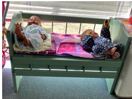
Repaired and painted dolls bed